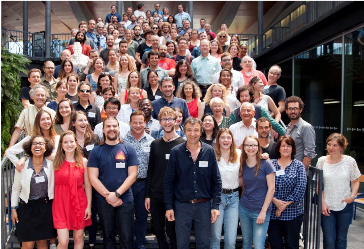
Photo of the 2018 DCLDE participants